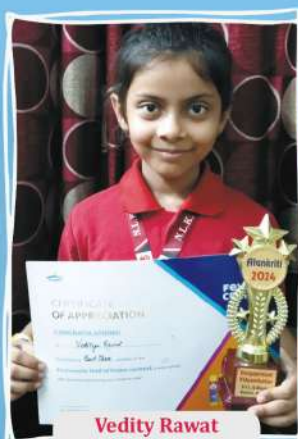
Vedity Rawat II Moon