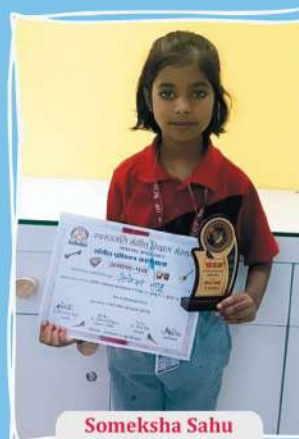
Someksha Sahu III Sun