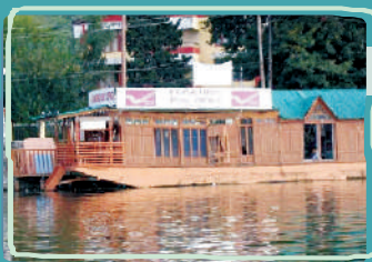
India has a floating post office in Dal Lake, Srinagar.

Snakes and Ladders originated in India : With its history dating back to the 13th century BC, this popular board game is believed to have originated in India.