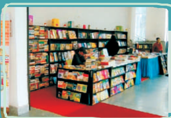
The Kanpur Book Fair, organised by Book Mafiya, is an annual event held in July or August. This year, it took place from July 25 to 28, 2024, and featured over 500,000 books across 20+ genres. The fair aimed to promote literacy, foster a love for books, and bring the community together.